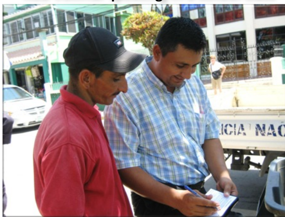
witnessing on the streets of Coxen