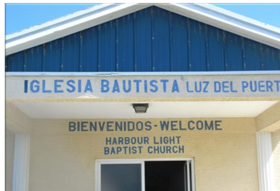
Roatán church in French Harbour