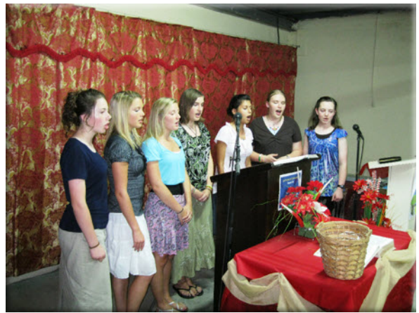
STAR Team Youth Sing in an Evening Church Service

How about considering joining a STAR Team next year? Call it a new kind of vacation – one with eternal consequences. You might not be on a team of 70, but, one thing is sure, wherever the gospel goes, people’s lives are changed forever.