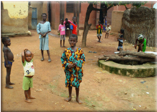
Children in the square of Mango, Togo

people speak a different African language. The programming there will tend more toward Christian edification. French is the common language of Togo, but much of the programming will be in the major African languages of Ewè in the south, and Kabiye in the north.