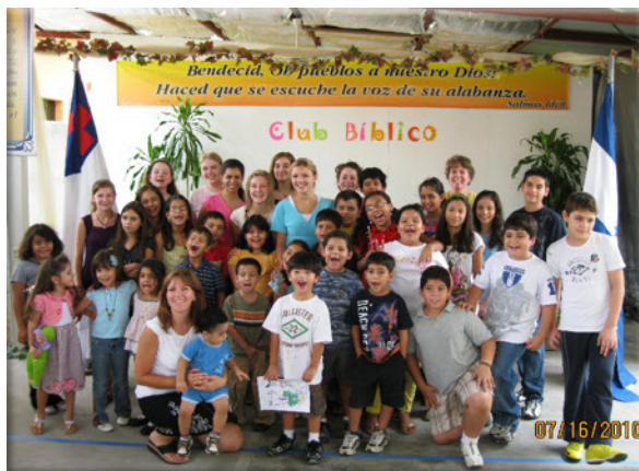
One of Two Vacation Bible Schools

Every team member agreed that it would be worth making all that effort if only one person had received Christ. It is impossible to describe the excitement of knowing that over 1,500 names are written in heaven because