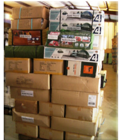
Tent Shipment for Haiti

many rainy nights have gone by, but we are very thankful that you have helped us meet a vital need for a people who have very little hope and need a lot of help. Just today, we received several hundred book bags which we are going to send to the school children who don’t have the basic supplies needed to go to school. Please continue to pray for BBI’s involvement in Haiti.