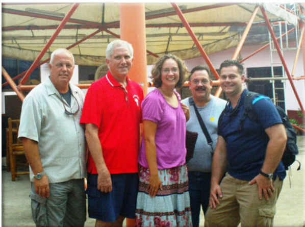
Togo Survey Team