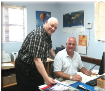
Doing the Necessary Checking Financial Records