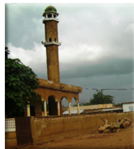
Local Togo Mosque

Our question right now is not, "To go to TOGO or not?" It is, "how can we not go to Togo?" when it seems that God is opening a door of opportunity to us. ■