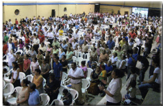
1,200 Attend City-Wide Crusade

Local Church Centered – One vital element of BBI's STAR ministry is that its campaigns are coordinated with local churches in the target community and are largely executed by church leaders and members. BBI organizes and provides overall strategy and structure, as well as materials and key team members; yet, it is the local churches who do much of the "ground work." BBI seeks not only to reach people for Christ, but also to strengthen and equip local churches to reach their own communities. In El Progreso, thirteen local churches partnered with us. They supplied translators and other members who provided transportation and some of our meals. Other