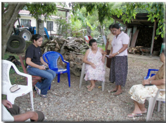
Sharing the Gospel One-on-One

Taking advantage of these opportunities, each team member shared the Gospel one-on-one in a personal manner, leading many to receive Jesus as Lord and Savior. Not even the complication of witnessing through a translator could confine the awesome impact of the Gospel as the Holy Spirit gave understanding.