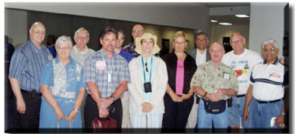
STAR Team on the Way

A Good Reception – On the whole, the Honduran people are very receptive and responsive to people from the U.S. Local church people made appointments for us to visit in homes where we could share the Gospel with people who were expecting us. They took time to hear what we had to say and ask us questions. People usually pay special attention to teams who have traveled great distances: “What might these strangers have to say that is so important that they would come so far to see me?”